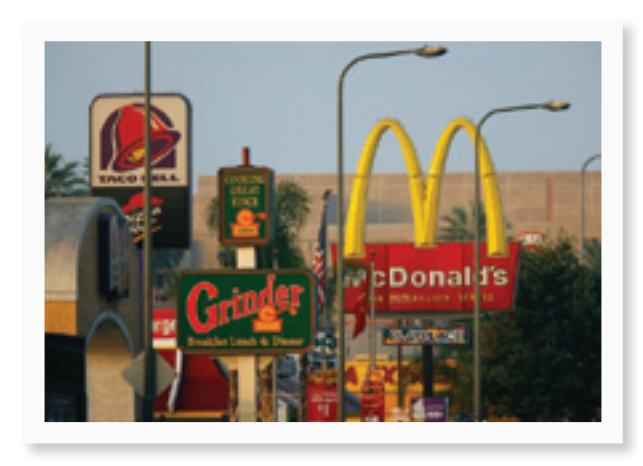
Fast food saturates communities throughout the U.S. including this busy street in Los Angeles.

By now, most of us have heard the gloomy health statistics. Millions of people across the United States suffer needlessly from diet-related conditions, putting an increasing burden on our already broken health care system. And, kids are especially targeted by the likes of McDonald's, through toys, playgrounds and other tactics that exploit children's unique vulnerabilities.