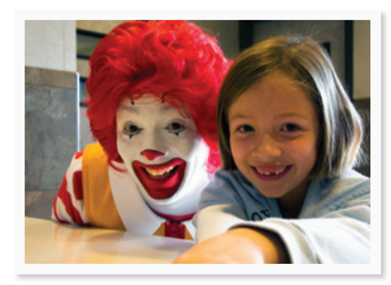
Ronald McDonald epitomizes McDonald's suite of tactics used to market the brand to kids. This predatory marketing targets kids to hook them for life.

While we've seen much attention devoted to how federal agricultural subsidies support all the wrong foods, little focus has been directed toward subsidies at the local level. Indeed, state and local tax breaks as well as other business incentives help fuel fast food expansion. Communities can demand such economic development policies be redirected from supporting damaging fast food toward more health-promoting foods.