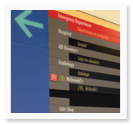
McDonald's has restaurants in hospitals across the country sending the wrong message to patients and staff about healthy eating.

A study of fast food in Chicago found that almost 80 percent of schools had one or more fast food outlets within half a mile. Chicago is not the exception. Fast food clusters within walking distance from schools, and the average distance between any U.S. school and the nearest fast food outlet is about a 7.5 minute walk.<sup>73</sup> A study by researchers from the University of California Berkeley and Columbia University found that teenagers whose schools are within one-tenth of a mile of a fast food outlet are more likely to be obese than those whose schools are further away.<sup>74</sup> Using zoning to reduce the density of fast food outlets near schools would help protect children from the health risks associated with consuming too much fast food.