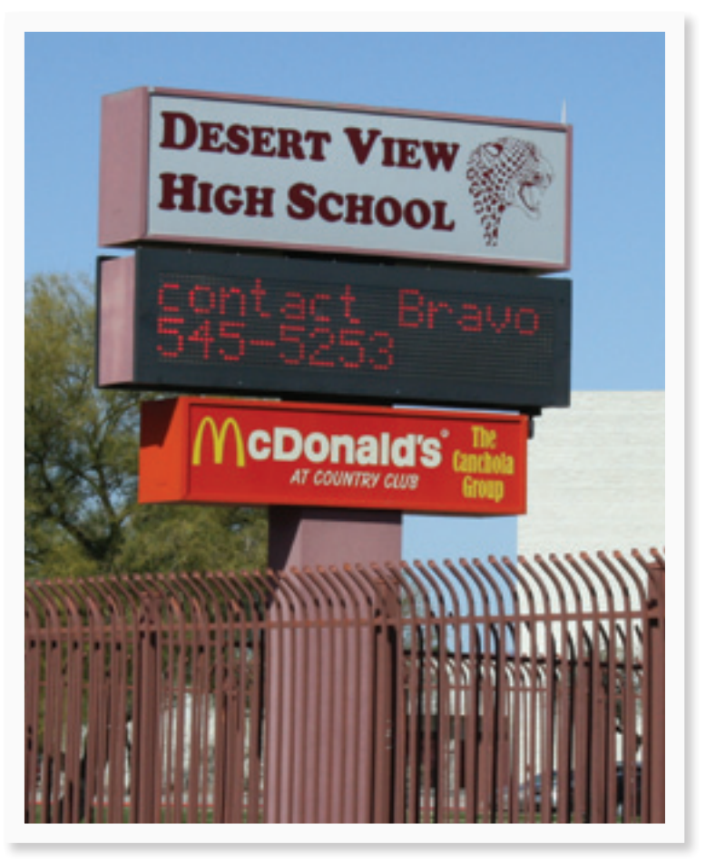
Desert View High School in Tucson, AZ is one of many schools across the U.S. where McDonald's and other fast food outlets serve food high in fat, sugar and salt directly in the school cafeteria.

Like many businesses, fast food corporations cut costs to attract customers. One method corporations employ is the substitution of cheaper ingredients for pricier ones. As a result of various federal crop