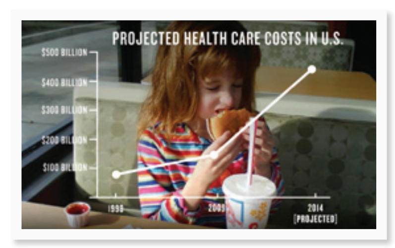
The rise in diet-related disease is a large contributor to rising health care costs. In the U.S. one in three children born in the year 2000 is predicted to develop type-2 diabetes—the first generation with a shorter life expectancy than their parents—all as a direct result of diet.

Since the sub-prime mortgage crisis of 2008, more and more people have come to feel that it is unfair for big corporations to profit by speculating on the well-being of the 99 percent who aren't multi-millionaires. Just as many want to hold big banks and speculators accountable for the damage to the economy and the misery they have caused, and the tobacco industry accountable for its legacy of illness and death. Many now feel it is time to tell the fast food industry to stop sacrificing our health for its profits.