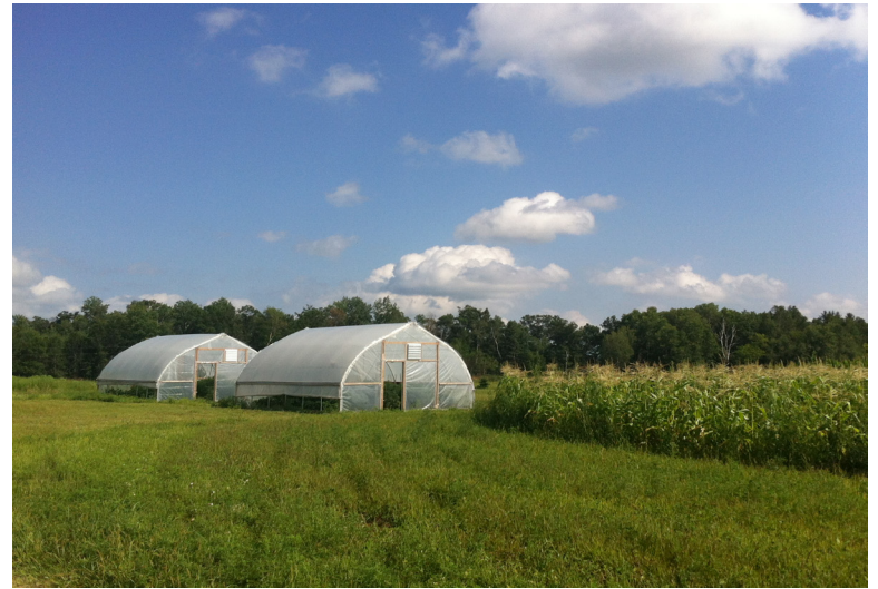
The Farm on Saint Mathias in Brainerd, MN.

Rural food insecurity remains one of the most vexing challenges in the United States. In central Minnesota, Region 5 is emerging as a leader in using policy to address food insecurity and agricultural viability in a rural context. In face of high rates of unemployment, food insecurity, and poor health, Region 5 has built on its own assets to build a resilient region. Driven by a desire to improve its own community, and not solely relying on assistance from outsiders, many different governmental and non-governmental groups have come together to combat food production and food security challenges through lasting policy change. As early as 2007, this rural region recognized the local food system as one of its strongest community assets and has made concerted efforts toward creating a regional food system that generates local wealth and provides access to healthy, affordable foods.