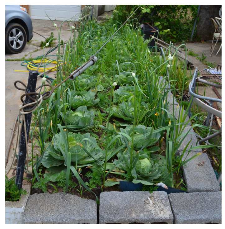
A network of urban farms and community gardens is supported by multiple community organizations.