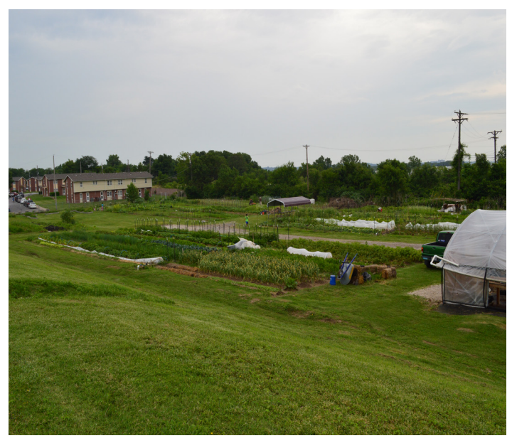
Juniper Gardens located adjacent to Juniper Gardens public housing provides training to new farmers, including long-term residents and refugees.

This brief, which draws on interviews with Wyandotte County stakeholders and secondary data sources, provides information about local government policy opportunities and challenges in the food system to inform the work of the GFC steering committee and stakeholders in Wyandotte County.